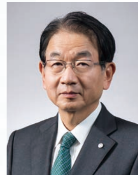
Representative Director, Chairman, President & CEO

We will update you on our progress as we meet new challenges.